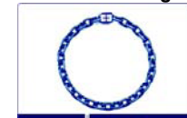
Chain Variable Vectograph